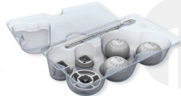
Quattro™ PnP SINGLE-USE INSTRUMENTATION